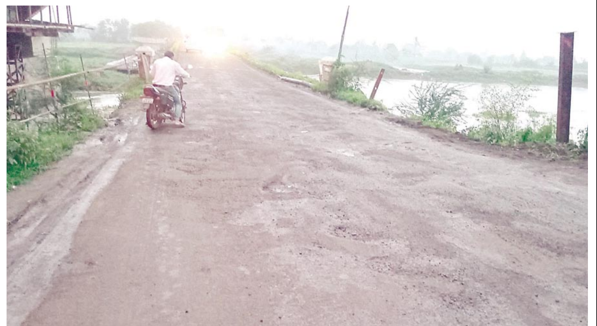
Potholes have once again surfaced on the Chandori-Saikheda bridge over the Godavari river, adding to the growing concerns over the lack of safety measures. With no protective railings on either side, commuters are forced to risk their lives while crossing the bridge. Locals from Chandori and Saikheda have urged authorities to repair the potholes immediately and install railings on both sides to prevent mishaps.