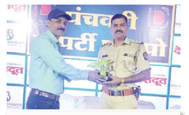
The 'Deshdoot Property Expo' is sponsored by Harshal Hanmante Builders and Developers Pvt. Ltd., a renowned name in Nashik's real estate sector with a legacy of 37 years as a trusted family builder. Bank of Maharashtra has joined as the financial partner, while Papayas Nursery is the environmental partner.

A significant number of visitors showed keen interest in purchasing homes. As the Expo enters its final day, organizers have appealed to the citizens to visit the Expo between 2 pm and 9 pm today, as this is the last opportunity to explore the available properties.